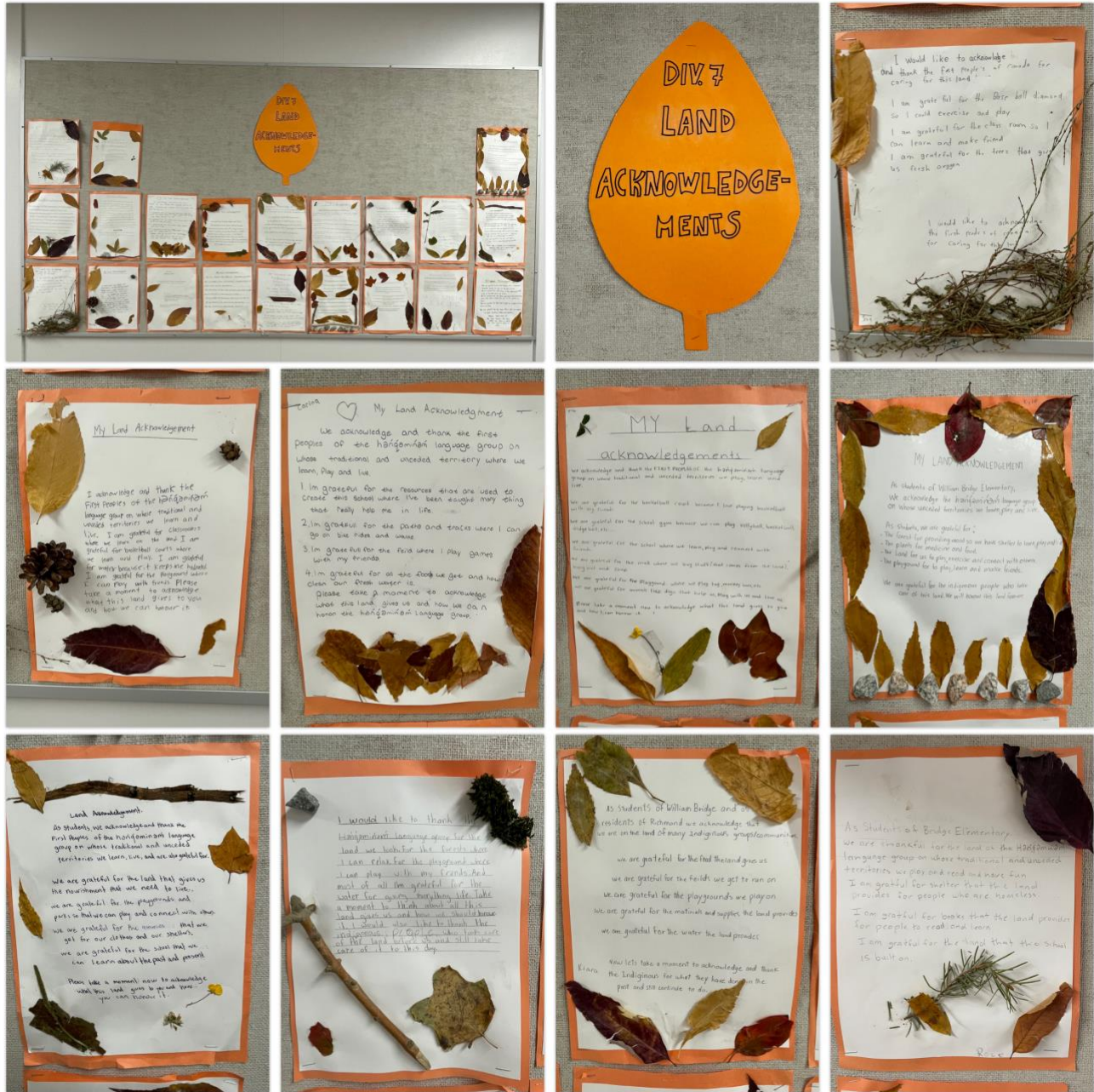
Division 7s personalized Land Acknowledgements