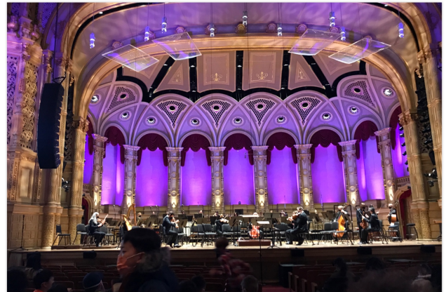
April Fool's Day in Division 1