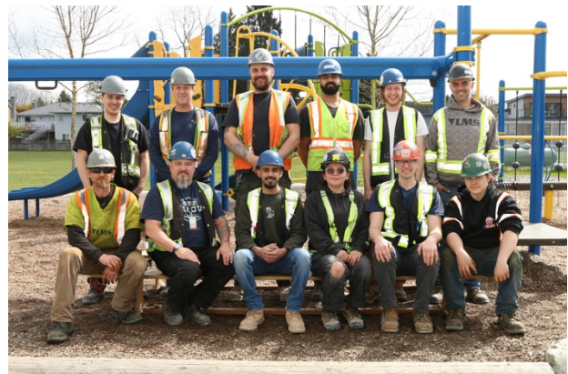
Our wonderful construction crew

Please check your child's backpack for their class photo.