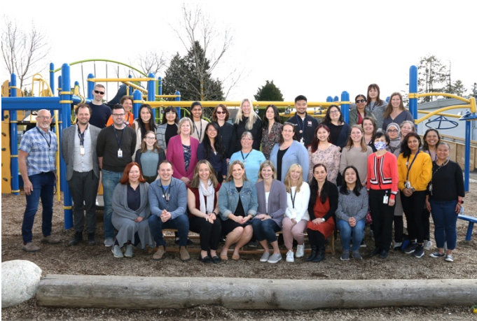
Our amazing Bridge Staff

Victoria Day – school not in session PAC Hot Lunch - Subway – pre-orders only Toonie Talent Show returns! More info coming soon. Welcome to Kindergarten morning at Bridge Sports Day Grade 7 assembly and luncheon Year End Assembly