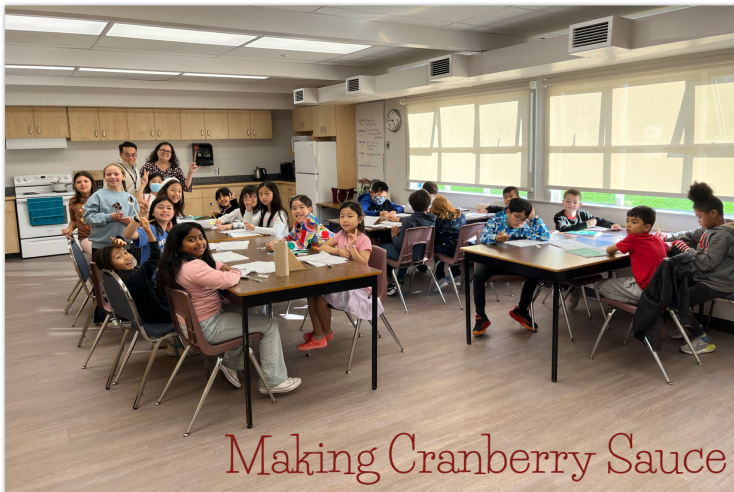
Making Cranberry Sauce