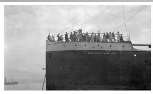
Passengers aboard the SS Komagata Maru in 1914

https://www.thecanadianencyclopedia.ca/en/article/komagatamaru#: ~:text=The%20SS%20Komagata%20Maru%20was,of%20the%20First%20Worl d%20War