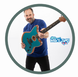
Will's Jams Musician