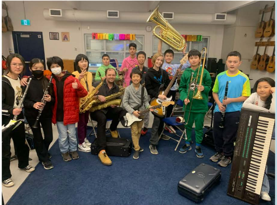
The William Bridge Elementary Jazz band comes together at lunch to play a wide variety of Jazz, Soca, and Blues songs. These young talents demonstrate their keen musicianship with creative solos, quick tempos, and a genuine love of music.