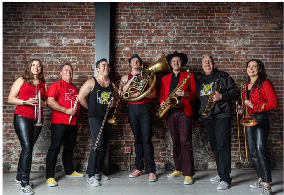
Cookin' With Brass is a high octane band that supercharges Top 40 Pop songs with their universal party groove. Known for their heart pounding energy, this Funky Brass Band turns any event into a raucous family friendly New Orleans street party. Their repertoire spans I Want You Back by The Jackson 5 to I Just Might by Bruno Mars plus New Orleans Brass Band favourites.